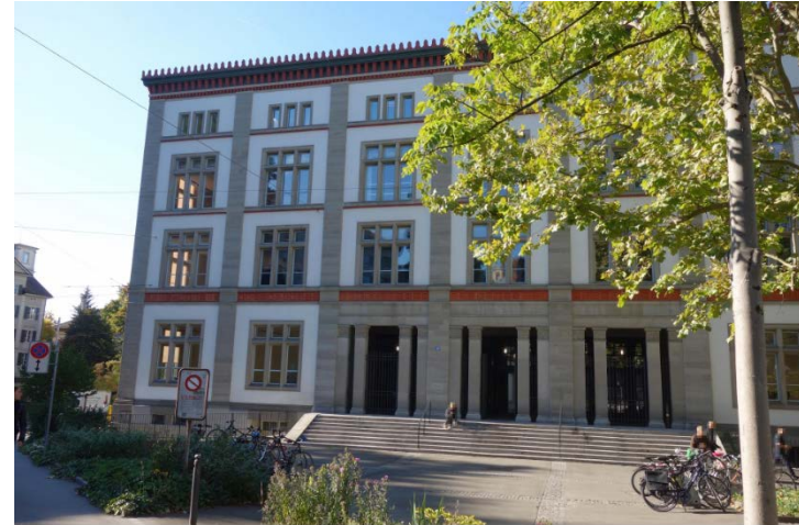
Workshop venue RAA at Rämistrasse 59, 8001 Zurich

08.45 Check-in 09.00 Parallel sessions D1-D3 10.30 Coffee break 11.00 Parallel sessions E1-E3 12.30 Lunch break 13.30 Parallel sessions F1-F3 15.00 Coffee break 15.30 2 nd keynote lecture 16.45 Closing address 17.00 End of the 11 th Accounting Research Workshop